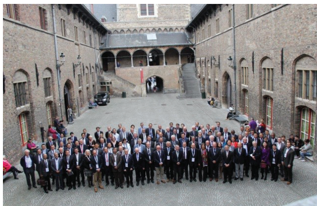
The delegates inside the Belfry Hall