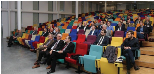
Presentation of the 'Brussels Canal Plan' at the General Assembly

The General Assembly took place on March 18, 2016 at the Congress Centre BEL in Brussels. About 50 members participated in the meeting. After the statutory part of the meeting, there was a presentation of the 'Brussels Canal Plan' and site visits of the Upsite Tower and the construction site of the new H. Teirlinck building in the afternoon. According to good Belgian tradition, a tasty lunch was offered as well.