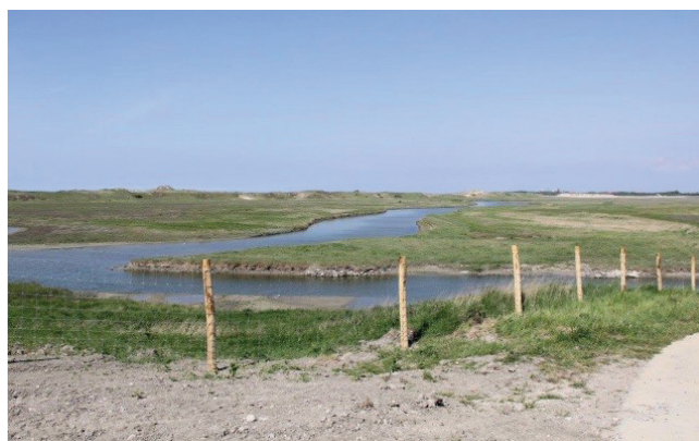
The natural reserve 'Het Zwin'

Those who unfortunately skipped the lunch and the visit to the brand new Zwin, natural reserve and international bird airport, missed a great opportunity. Even before the opening of this interactive exhibition building on June 10, the AGA 2016 gave a unique pre-boarding card for an interesting visit over the Zwin plain on the Belgian-Dutch border.