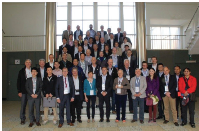
The participants of the seminar

Sea", as well as an introduction to and visit of the Port of Zeebruges.