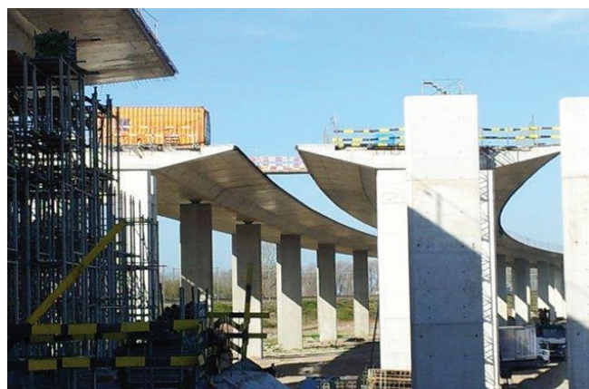
The new viaduct of the A11

On April 20, 2016, The Belgian Young Professionals gathered in Bruges for a technical visit to the