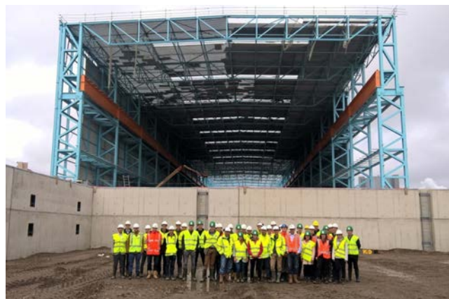
The YP's visiting the Maasvlakte 2

In collaboration with the Dutch Young Professionals we organised a visit to the Maasvlakte 2 on June 30, 2016.