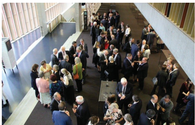
The pre-banquet reception

In the evening, a banquet was offered at the Bruges Concert Hall, in a socialising atmosphere between the many delegates and their partners.