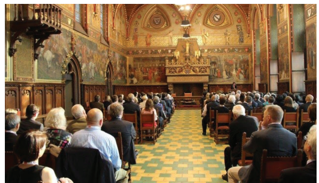
Welcome at the historical City Hall

On Tuesday, May 17, 2016, the ExCom meeting took place all day long at 'De Caese', the former official residence of the treasurer of the 'Brugse Vrije', the countryside around Bruges at the end of the 14 th century, nowadays receiving house of port Authority of Zeebruges.