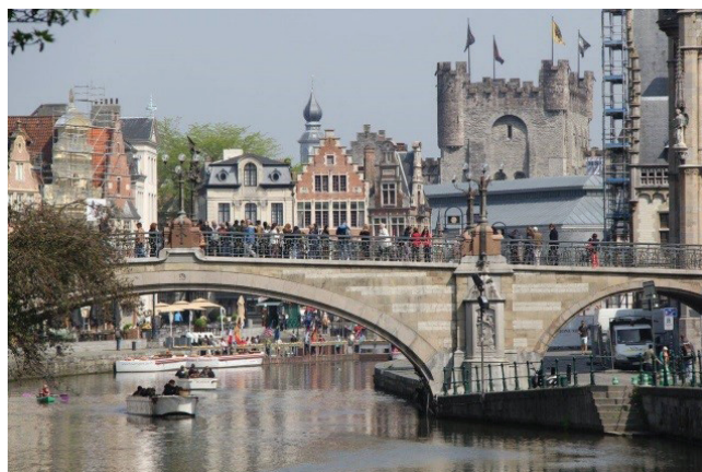
Visit to the city of Ghent

A programme for the Accompanying Partners, 43 in total, was set up, including a visit to the city of Ghent on May 17 and Bruges on May 18 and May 19.