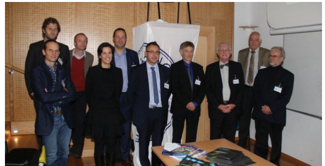
The speakers and organisers of the SPW seminar

Finally, on November 18, 2016 the 7 th 'international' autumn seminar of the 'Service Public de Wallonie' was organised in Namur by the Walloon Directorate-General for Mobility and Waterways. The theme of this year's seminar was 'Inland Waterways, Future Roads, Paths to the Future of Wallonia'. The seminar gave us a view on the waterway from various perspectives.