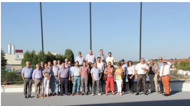
Participants in the Summer event 2016 on the new bridge on the river Lys in Harelbeke

The traditional summer event was organised at the construction site of the new lock in Harelbeke, September 9, 2016.